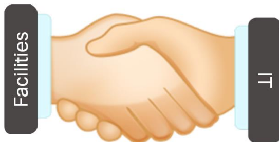
Figure 1. Bridging the Gap between Facilities and IT

Both departments strive to deliver a reliable and stable service to the rest of the enterprise. The energy concerns of each department are different, however. Facility managers need to make sure that costs are kept as low as possible, while still delivering the necessary amount of power to the company. IT is under pressure to deliver ever increasing computing capabilities to the business, while also maintaining service-level agreements.